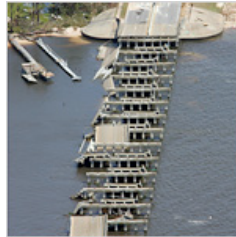
Bridge Restores a Lifeline to a Battered Town