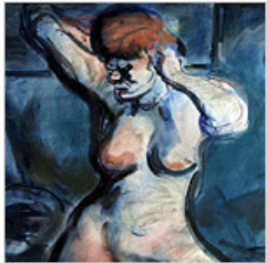
Revisiting Rouault's Stained-Glass World