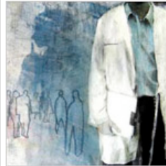
When Doctors Break a Confidence