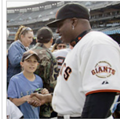
Araton: Selig Cannot Look Away This Time